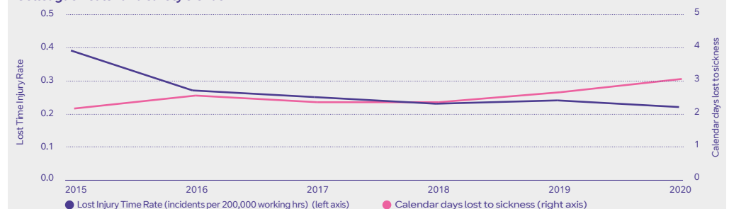
Colleague health and safety trends